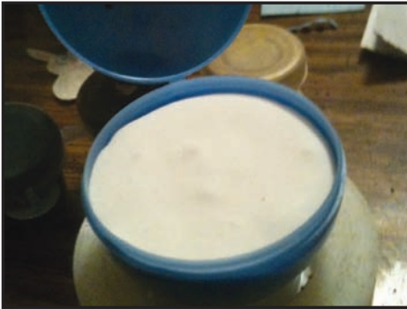
Fill bottom half of egg with Modeling Clay or Casting Plaster. Allow to harden.