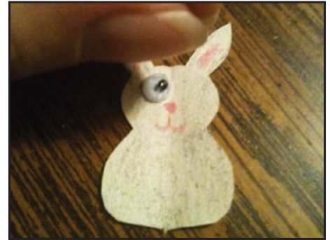
Cut bunny out of construction paper and decorate with markers.