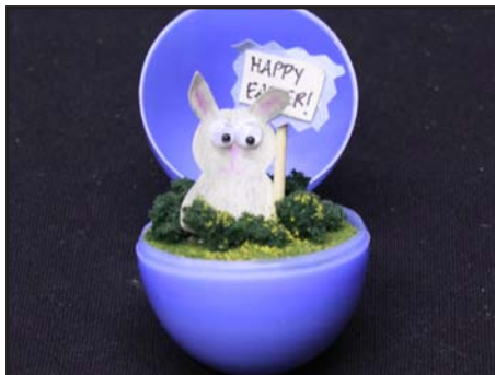
Glue Bushes, sign and bunny in place. Sprinkle Yellow Flowers over all. Spray with Project Glue to seal.