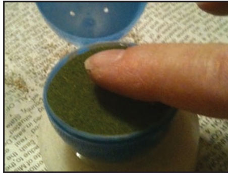
Cover with Green Grass Turf. Spray with Project Glue.